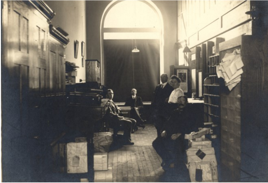
Interior, St. Helena Star Building, ca 1910

Newsletter of the St. Helena Historical Society, Summer 2003