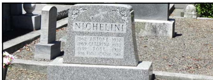
On this walk, you'll see the final resting places of some of Napa Valley's most notable wine family members. You'll discover the plots for the Mondavi, Komes, Nichelini, Trinchero, and Korte families.

"Holy Ground: Discovering Holy Cross Cemetery" is the theme of the St. Helena Historical Society's tenth annual "Spirits of St. Helena" Cemetery Discovery Walk. The event will be held on Saturday, September 22, from 10:00 until noon.