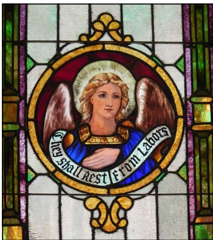
This is one of the beautiful windows in St. Mary's Chapel, built in 1904 at Holy Cross Cemetery. The chapel was renovated in 2006.

A Cemetery Discovery Walk at Holy Cross Cemetery Saturday, September 22, 10:00 am – Noon