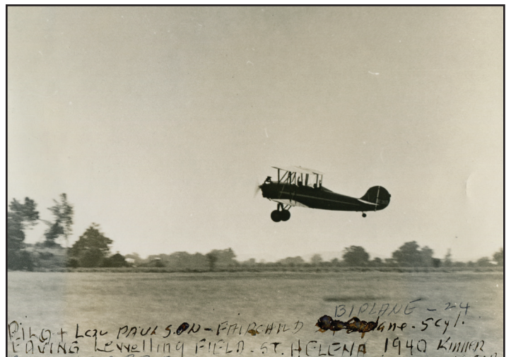
One of the historic photos in the recently acquired Paulson Family Collection.

Give us a call at 967-5502 if this volunteer opportunity appeals to you.